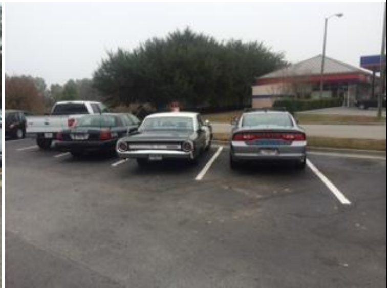
Photos of the club police cruiser with two Lake Park police vehicles parked on either side before the Lake Park Christmas parade